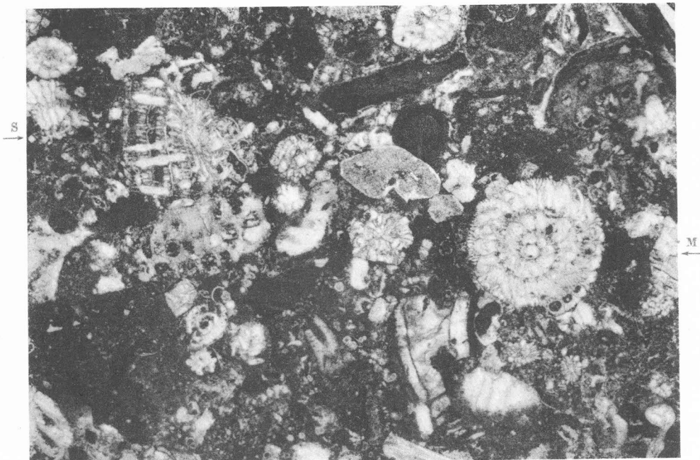
1. Miscellanea cf. miscella (D' ARCH.) (M) e frammenti fluitati di Siderolites (S). Paleocene. Prof. XIII, Strato 14. 14 ×.