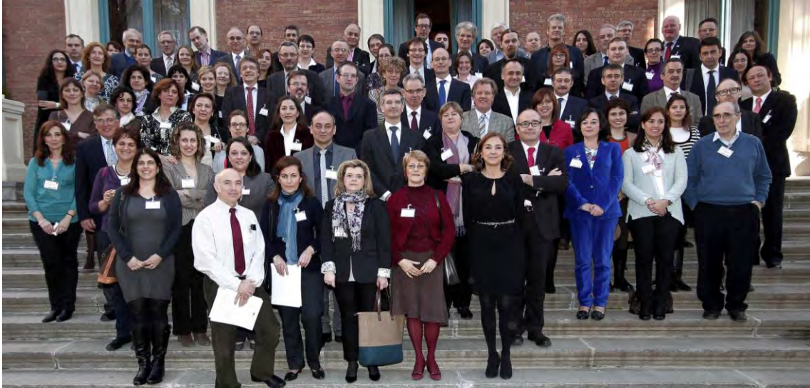
The Water JPI Community gathered in Madrid on February 2013.