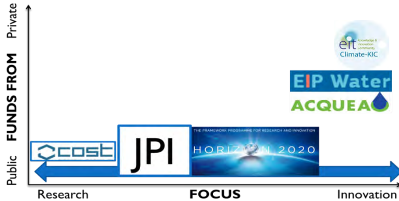
Figure 1. Selected agents in European Water RDI funding by focus and origin of the funds. (box size represents the centre of gravity of the initiative, not its funding volume).

Figure 2 separates the initiatives in the mapping space by introducing the funding target (public vs. private performers) in the ordinate axis. Horizon 2020 will increase funding to private performers as compared to FP7. The Water JPI will fund private performers, but in a lower fraction than Horizon 2020 is deemed to do. COST, largely targeting public performers, and the EIP on water, with a very strong interest towards private performers, are located on the extremes of the diagonal arrangement.