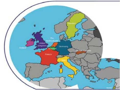
ERA-ENVHEALTH CONSORTIUM PARTNERS

It is estimated that around 20% of the burden of disease in industrialised countries can be attributed to environmental factors (EU Environment and Health Strategy 2004). Europe's citizens are concerned about the potential impact of the environment on their health and expect policy makers to act. Reducing uncertainties about the links between environment and health (E&H) and taking action through protection and prevention measures is therefore necessary. However, for these to be effective in the long-term, cooperation must be improved and research driven by a common set of priorities. ERA-ENVHEALTH, co-funded by the European Commission under FP7 "Coordination Actions", enhances European coordination of environment and health research programming to support effective policy-making.