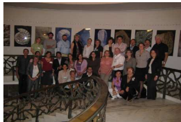
Rome, Italy, 25 Sept. 2009

This first discussion with the EAC members revealed interesting points for enhancing the project's impacts. These included: better integration of the strategic objective of evidence-based policy-making with a particular focus on theme definition; and implementing fast, concise and efficient through flow of information in order to increase dissemination.