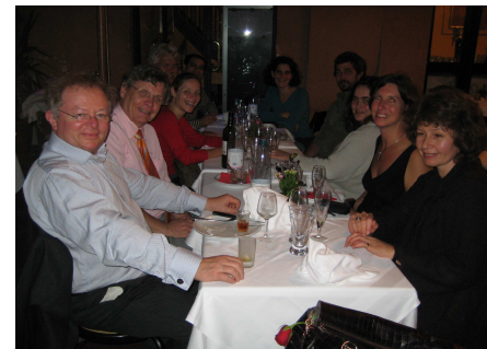
Rome, 23 September 2009, EAC dinner