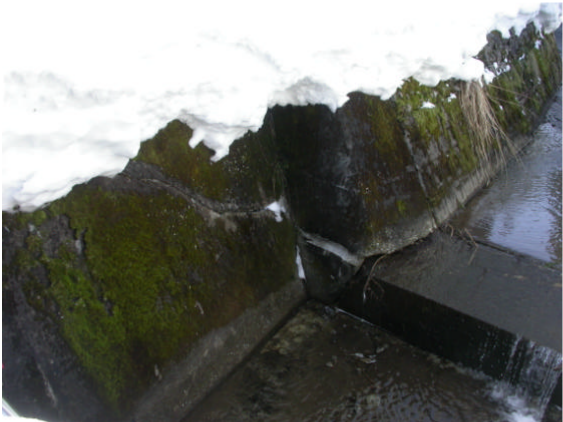
2004 Nijgata-Chuetzu epicentral area: a fracture displacing a lateral wall of a channel