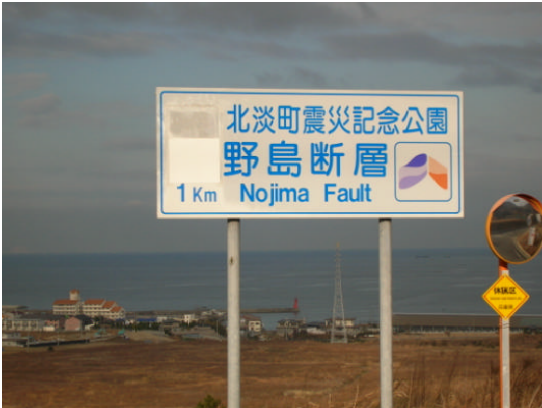
Hokudan: signals on the road indicate the location of the Nojima fault, which reactivated during the 1995 Kobe earthquake