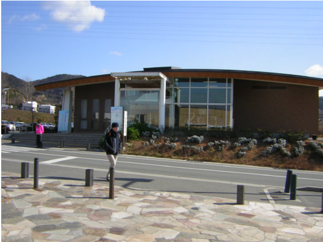
Hokudan: external view of the symposium area