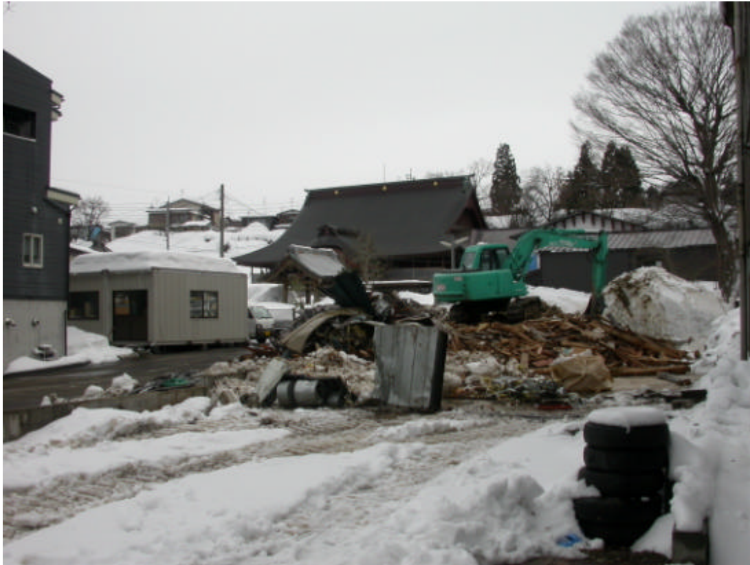
2004 Nijgata-Chuetzu epicentral area: a small house destroyed after the earthquake