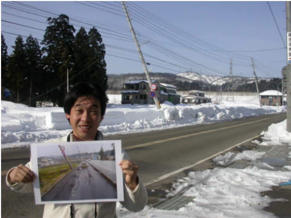
2004 Nijgata-Chuetzu epicentral area: a case of liquefaction which tilted the electric lines, covered by snow but evident in the picture.