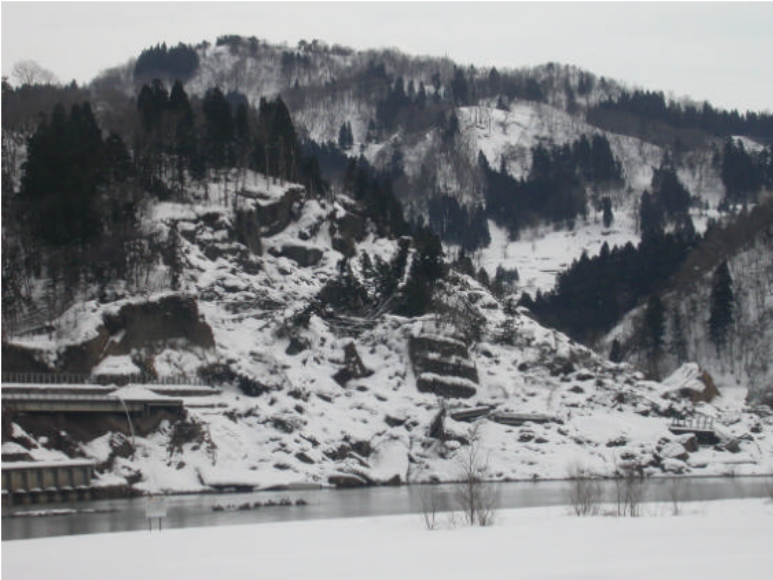
2004 Nijgata-Chuetzu epicentral area: a primary road interrupted by a huge landslide triggered by the earthquake