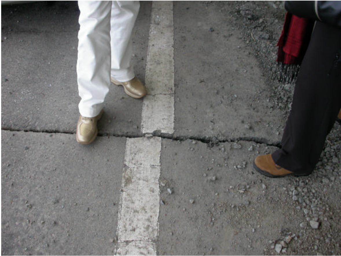
2004 Nijgata-Chuetzu epicentral area: an example of fracture displacing the road pavement