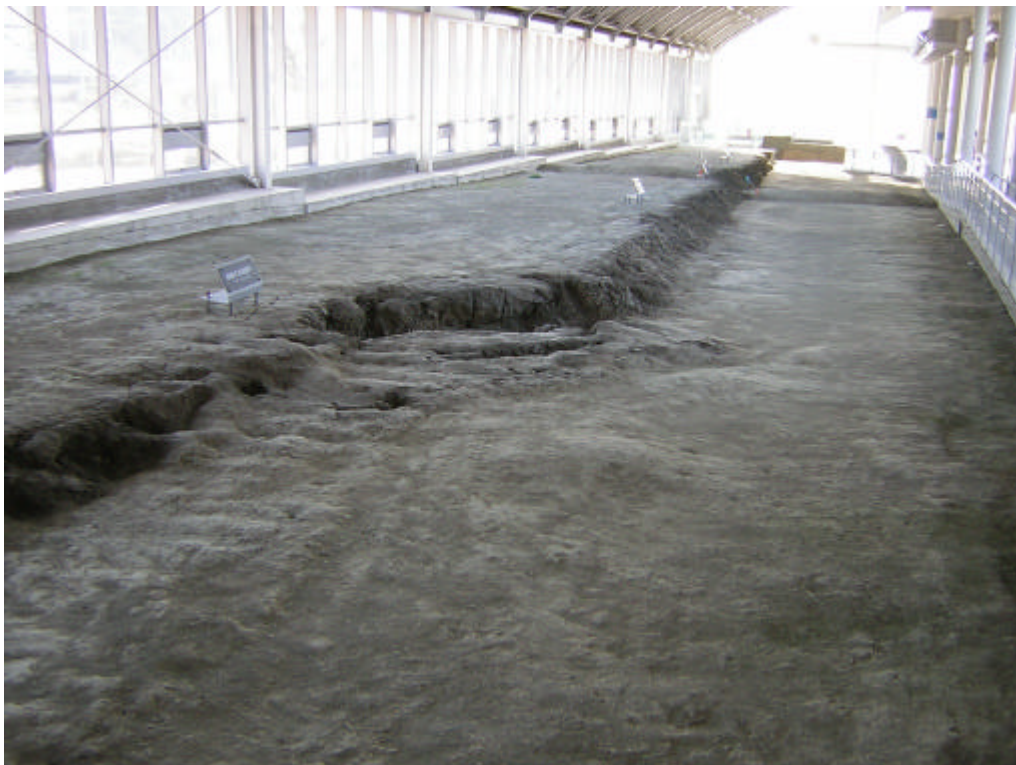
Hokudan: the trace of the 1995 fault rupture, as preserved in the Nojima fault museum.