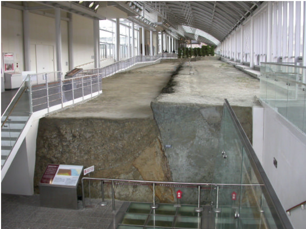
Hokudan the 1995 fault rupture of the Nojima fault in a panoramic view (up) and in section with S. Porfido (below).