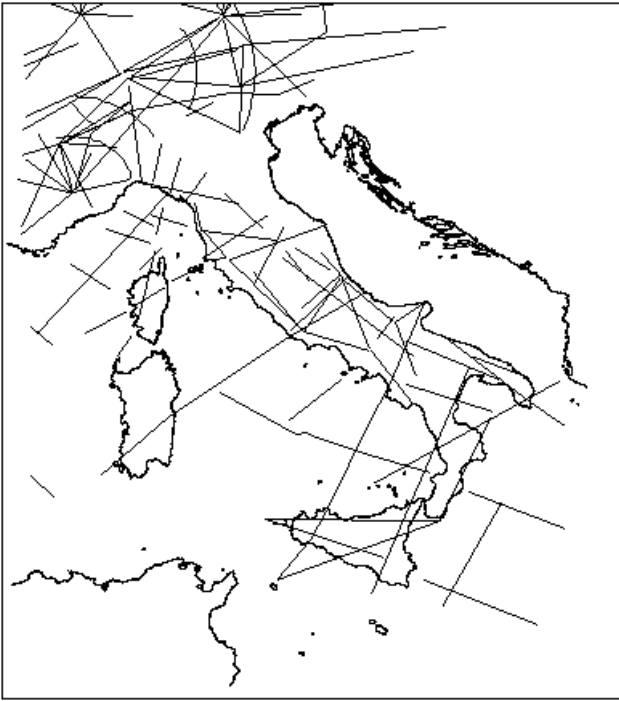
Fig. 1 - The Deep Seismic Refraction Profiles (DSS) acquired by OGS (21,160 km) in the period 1956-82

- I profili di Sismica a Rifrazione Profonda (DSS) realizzati dall'OGS nel periodo 1956-82 (21.160 km)