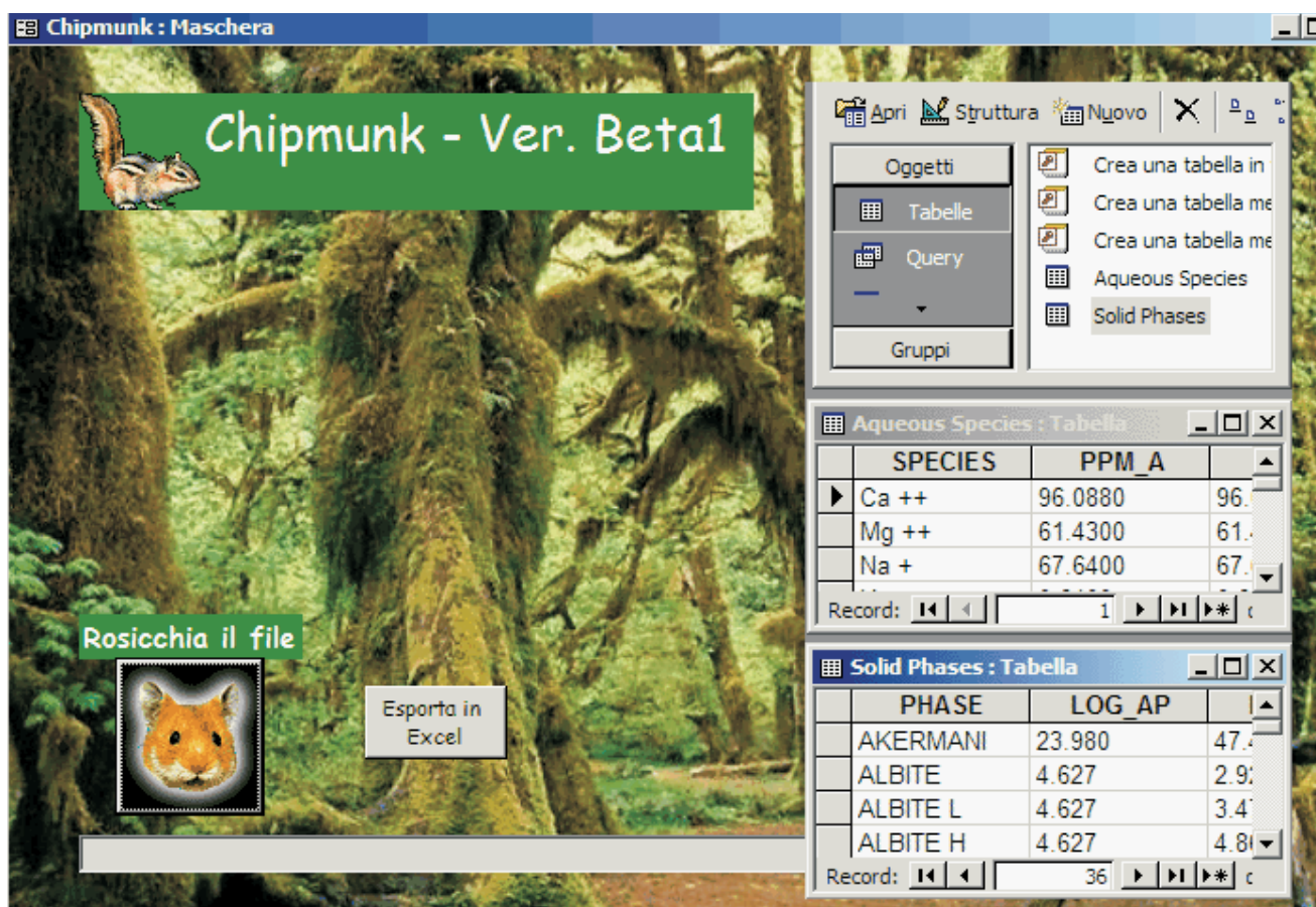
Fig 1 - Chipmunk (Microsoft Access application): in the background main mask of the application, on right resulting tables. - Chipmunk (applicazione in Microsoft Access): sullo sfondo maschera principale dell'applicazione, a destra le tabelle risultanti.

points, define individual areas of influence around each of a set of points. Thus, in terms of both the quantity and granularity of information generated, the cartographic representation of geochemical information is specifically suited to a G.I.S oriented environment. Geochemical evidence from speciation calculations confirms expected results.